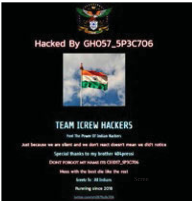
Screenshot of CAAN website

Banka with the message: 'Don't mess with Indians!' In retaliation hacker groups of Nepal were quick to make their moves where a hacker called 'SATAN' divulged fabric's API Key of ABP News. Then an anonymous Nepal-based hacker by the alias Omsec5 claimed to have hacked HDFC Bank's data while also leaking over 2,000 Aadhar card details of Indian nationals. Thankfully, though, as per ICT Frame, a cyber-space-oriented magazine, which has been reporting on cyber crimes and cyber security in Nepal, the Indian Cyber Troops, via their social media handle did try to bury the hatchet. The group's Facebook post dated May 22: "We've talked to Nepali hackers and now we are going to stop attacks. We are brothers. Establish peace," ending with #IaiHind and #Jai Nepal. However, things took a different turn after SATAN posted this on our sites: "We were gonna stop but some kids again started to deface our sites! We can't just sit back and watch. This is just a demo! #BackOffIndia." SATAN's retort has clearly exacerbated the situation. The In-